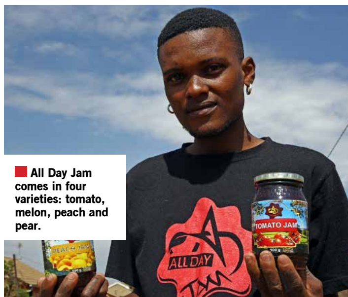
■ All Day Jam comes in four varieties: tomato, melon, peach and pear.

"My grandmother encouraged us to harvest produce during weekends and school holidays. After the harvest, she would make jam for us at home."