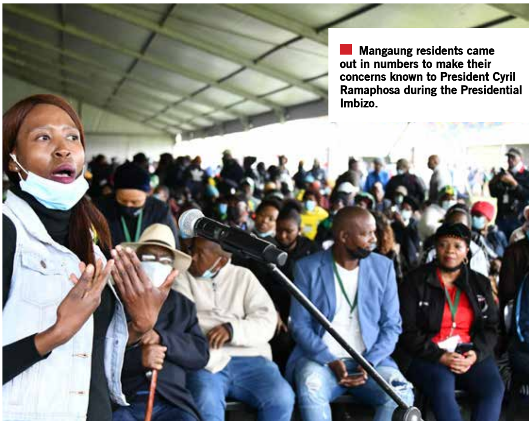
■ Mangaung residents came out in numbers to make their concerns known to President Cyril Ramaphosa during the Presidential Imbizo.

L ack of service delivery, corruption, inadequate housing and crime – these are some of the challenges President Cyril Ramaphosa has promised government will address in Mangaung Metro, Free State.