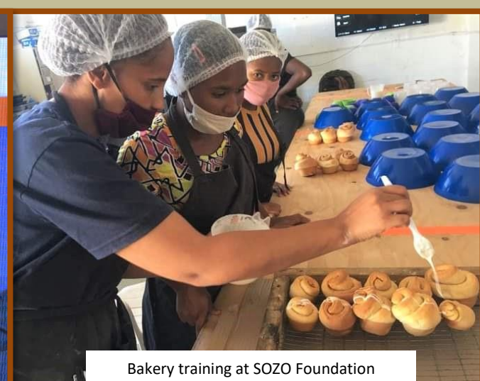
Bakery training at SOZO Foundation