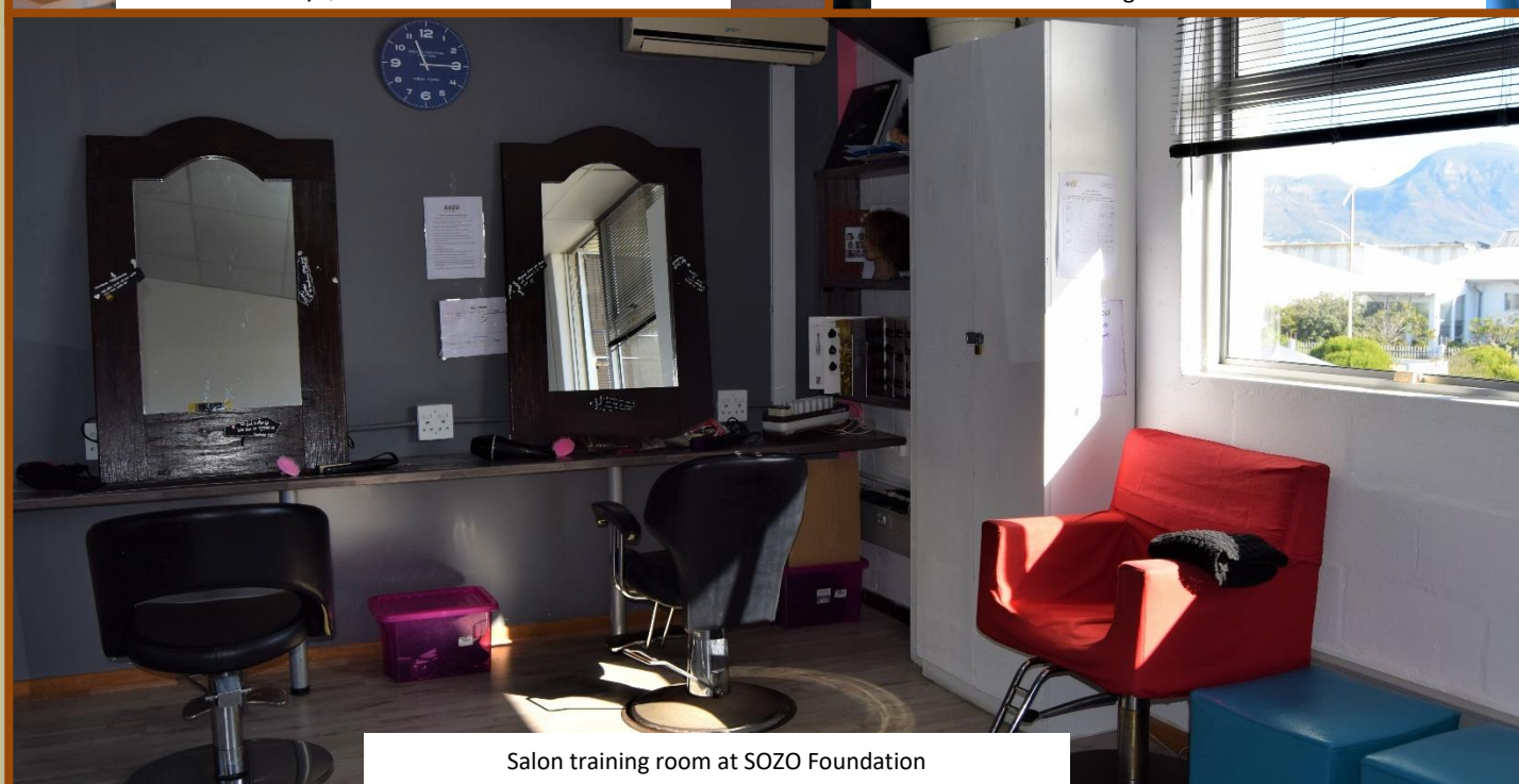
Salon training room at SOZO Foundation