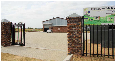
▲ Ntirisano Sanitary Towel Cooperative

Ntirisano Sanitary Towel Cooperative has 11 members, nine females and two males.