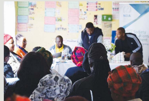
The Mayor, parents, governing body, ECD forums and primary school representatives attended the handover ceremony