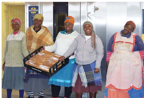
Members of Leratong Bakery in Qwa Qwa