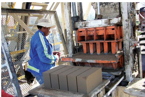
➤ Ttutfukani Brick Making Cooperative